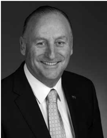
THE HON STEVE IRONS MP ASSISTANT MINISTER FOR VOCATIONAL EDUCATION, TRAINING AND APPRENTICESHIPS