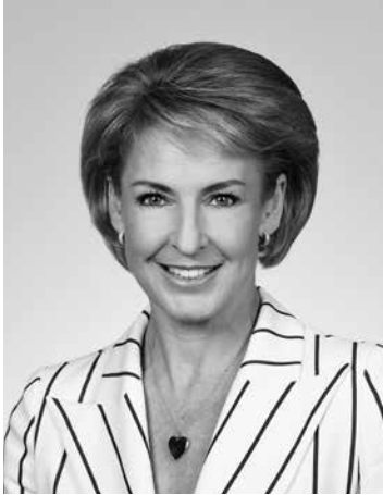
SENATOR THE HON MICHAELIA CASH MINISTER FOR EMPLOYMENT, SKILLS, SMALL AND FAMILY BUSINESS