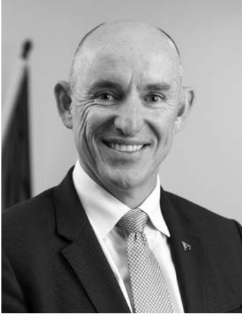
THE HON STUART ROBERT MP MINISTER FOR EMPLOYMENT, WORKFORCE, SKILLS, SMALL AND FAMILY BUSINESS