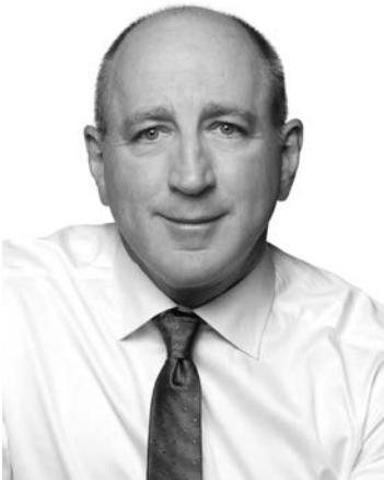
THE HON LUKE HOWARTH MP ASSISTANT MINISTER FOR YOUTH AND EMPLOYMENT SERVICES